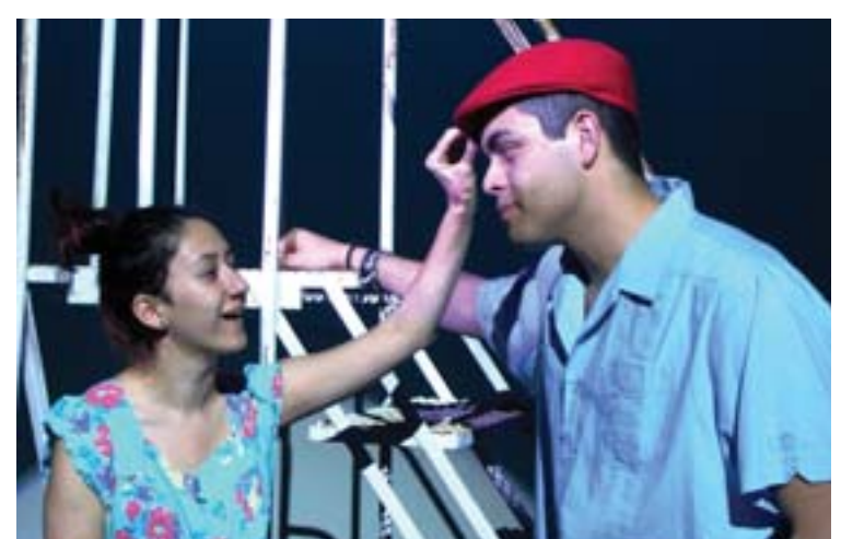
"In the Heights" is a modern "West Side Story."